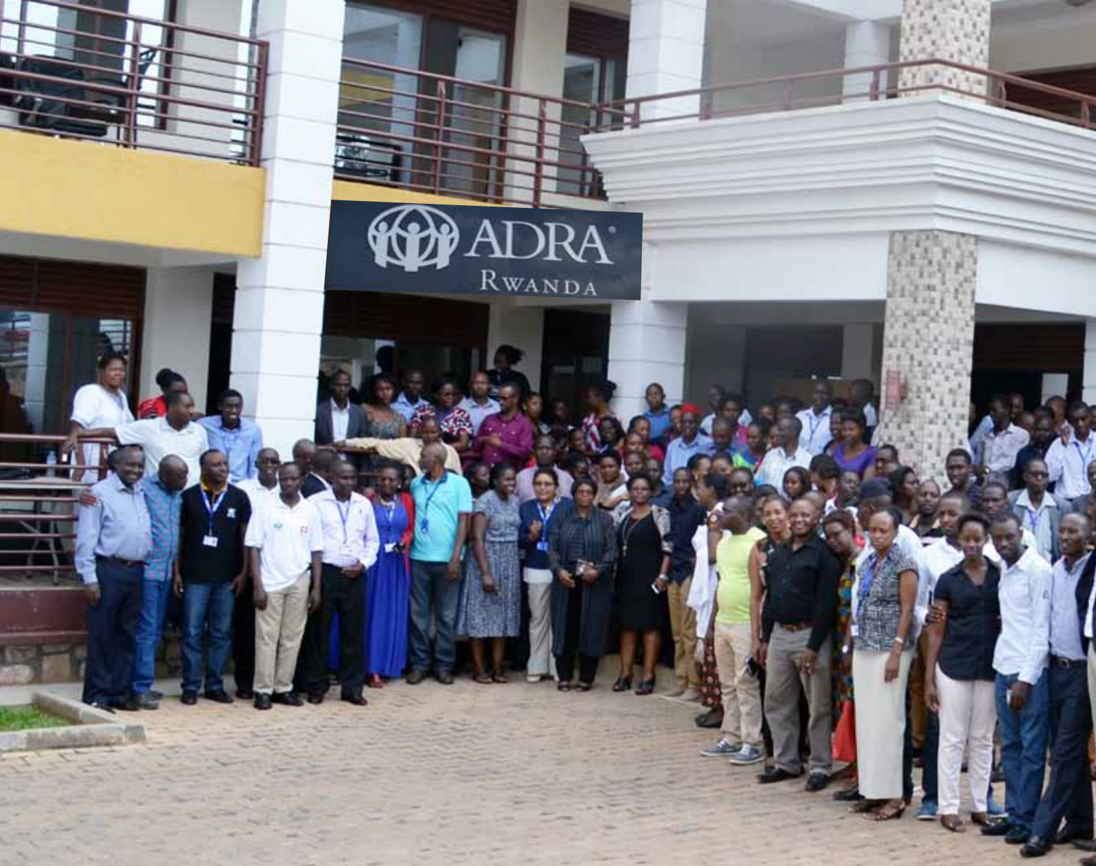
Section of ADRA Rwanda family