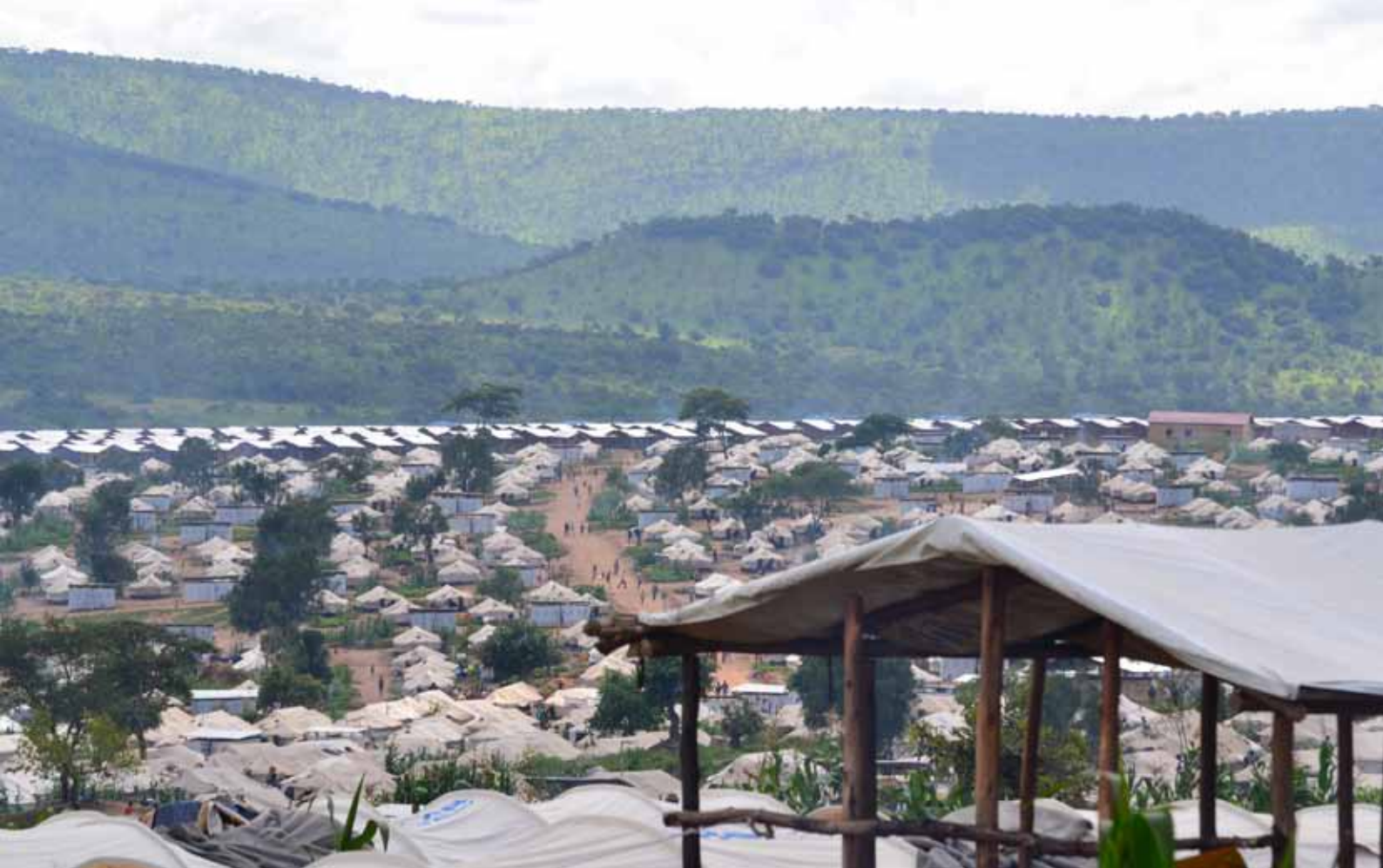
Mahama Refugee Camp, Kirehe District, Eastern Province.

ADRA Rwanda in partnership with WFP has been implementing the School Program in four Congolese refugee camps of Kiziba(Karongi District), Kigeme (Nyamagabe District), Nyabiheke (Gatsibo District) and Gihembe(Gicumbi District) since 2013. Additionally, two new camps; Mugombwa in Gisagara District (since 2014), Southern province and Mahama in Kirehe District (2015), Eastern province are also benefiting from the program.